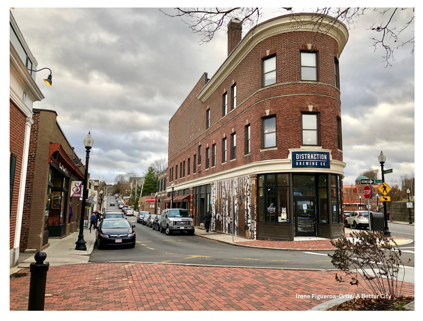
Figure 1: Photo of Birch Street